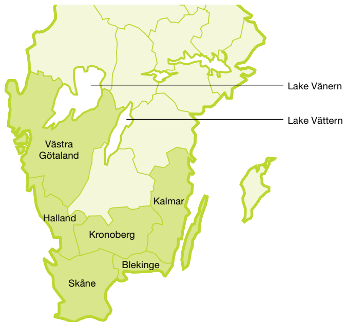
The counties and lakes mentioned in the document.

Many of the municipalities, network operators and power consumers who were affected by Gudrun were also affected by Per. Storm Per was, with certain local exceptions, not as devastating as Gudrun. On the other hand it affected a larger geographical area. As a result of the storm it is estimated that a total of 440 000 customers have been without electricity for a short or long span of time. The longest power cut duration was approximately 10 days.